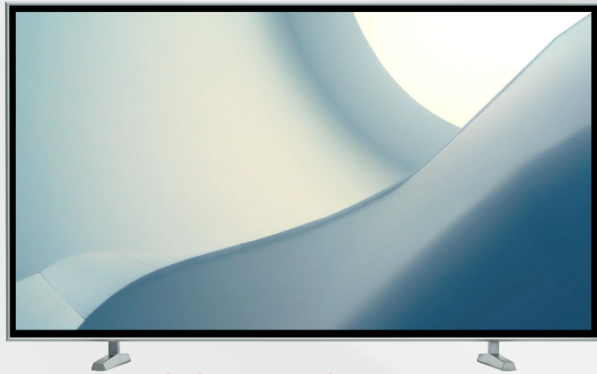
LG 65" LED Smart TV